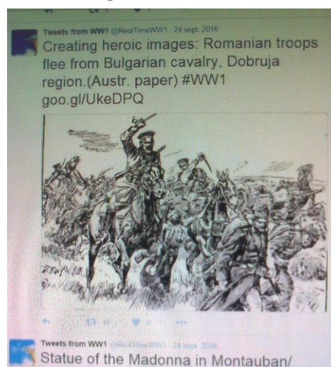
Fig. 1. Fights between Romanian Troops and Bulgarian Cavalry, Dobrudja

In the everyday tweets one can find images from the trenches, short describing of